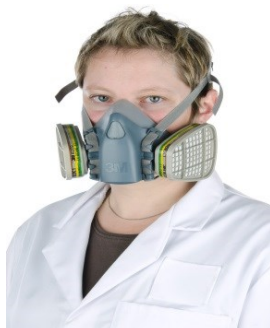
Figure 2 Reusable half mask