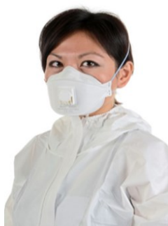
Figure 1 Disposable half mask