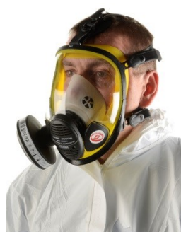
Figure 3 Full-face mask