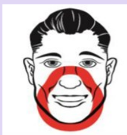
Figure 4: Example showing the face seal region (underneath the red line) that must be clean shaven for a half mask or Filtering Face Piece (FFP)

Research carried out by the HSE has demonstrated that protection could be significantly reduced where stubble or facial hair was present in the seal area. 11